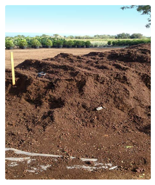
Avocados evolved in volcanic andosols, like this one on the slopes of Mount Etna, Italy. Doug said the soil looks similar to WA's pea gravel, however the particles float on water.

'We are trying to chemically get the soil similar to that which they evolved in, and biochar assists that.'