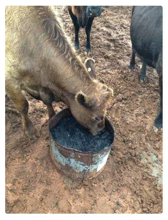
The biochar experiment started with the cows, feeding it purely as a test to see if, for almost no money, Doug could use two animals to sequester carbon into the ground. Not only does the cow and the beetle combination enhance the biochar but it's being dug very deep into the ground.

Soil health improvements from biochar include increased nutrient retention, reduced leaching, increased cation exchange capacity, improved soil structure and water-holding capacity, decreased soil acidity and increased numbers of