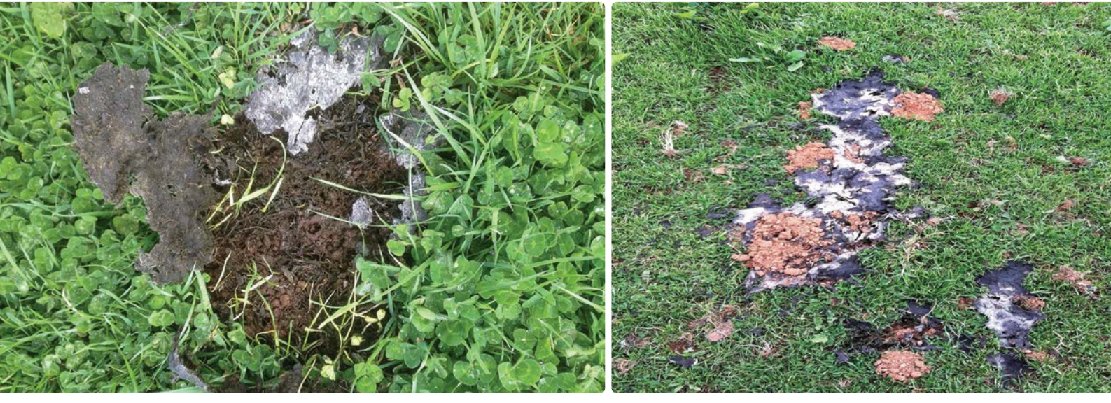
With very little investment, Doug has transformed his farm into a highly productive, low emitting ecosystem of plants, animals, bugs, fungi and microbes.